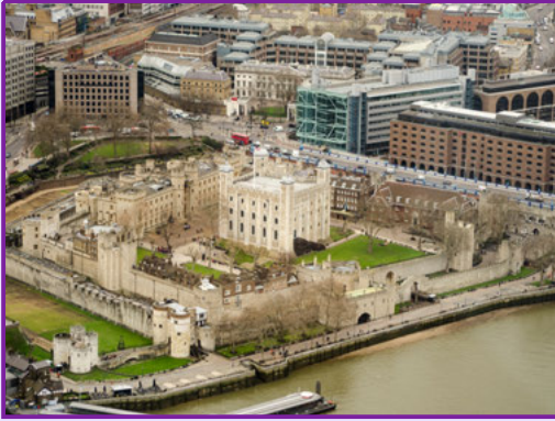
The Tower of London

Can you explain which land features each of the UK's capital cities, castles are built on or near and why the location was chosen?