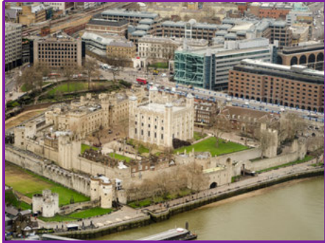
The Tower of London

Can you write a sentence saying which land features each of the UK's capital cities, castles are built on or near? You can use the word bank to help.