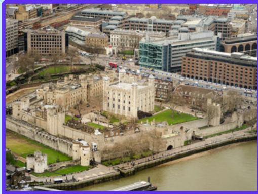
The Tower of London

Can you match the statements to each UK capital city castle?